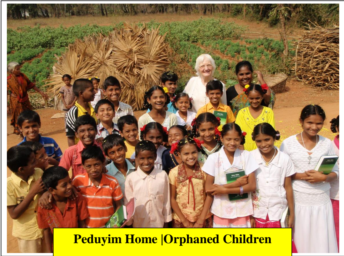
Peduyim Home |Orphaned Children