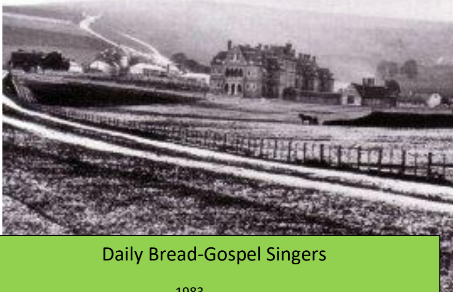
Daily Bread-Gospel Singers