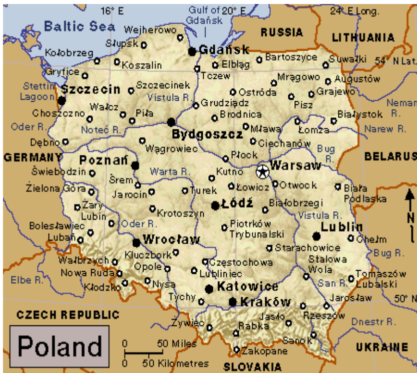
From World Book Multimedia Encyclopedia (TM) (c) 1997 World Book, Inc., 525 W. Monroe, Chicago, IL 60661. All rights reserved. Map data (c) 1997 GeoSystems Global Corporation. All rights reserved. World Book Multimedia Encyclopedia Map

Call unto me and I will answer thee, and show thee great and mighty things, which thou knowest not. Jerermiah 33 v 3