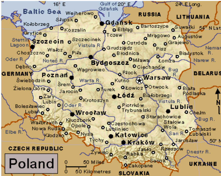
From World Book Multimedia Encyclopedia (TM) (c) 1997 World Book, Inc., 525 W. Monroe, Chicago, IL 60661. All rights reserved. Map data (c) 1997 GeoSystems Global Corporation. All rights reserved. World Book Multimedia Encyclopedia Map