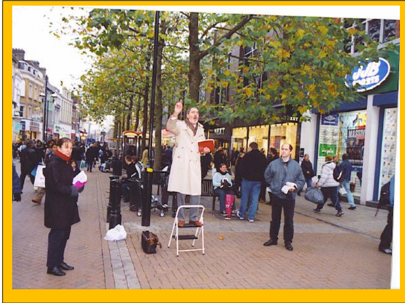
Preaching in Crawley