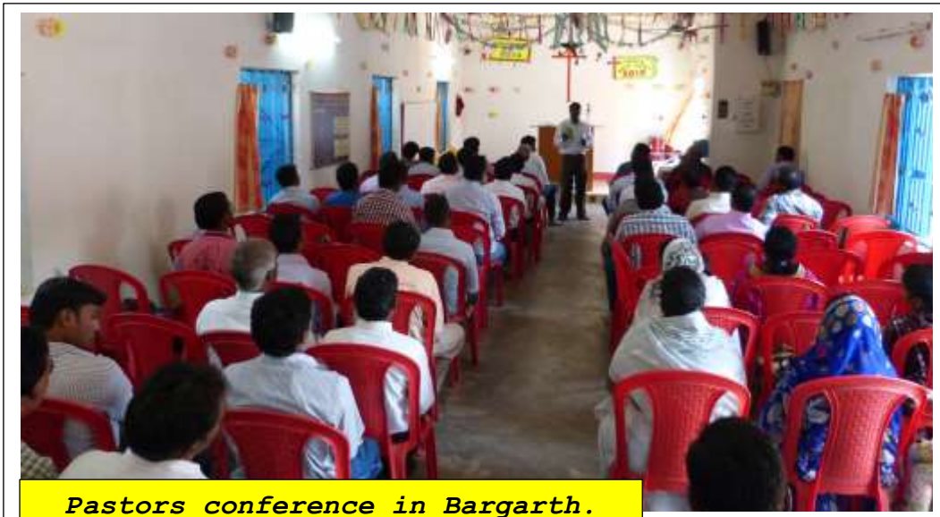
Pastors conference in Bargarth.