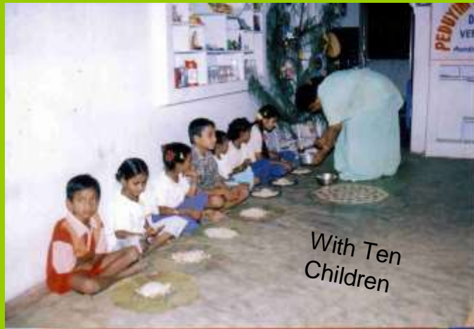
With Ten Children

Early Days in Peduyim Home. It started by renting a place for two orphans at £25 a month then there were 4 children and it grew with the Lords blessings.