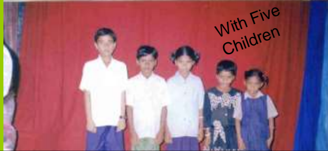
With Five Children