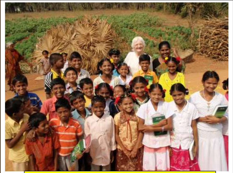
Peduyim Home |Orphaned Children