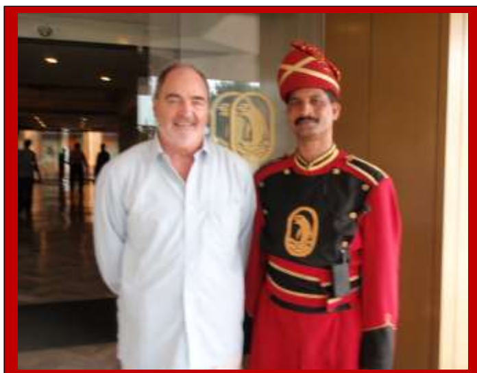
From the poor village to the palace e The Dolphin Hotel