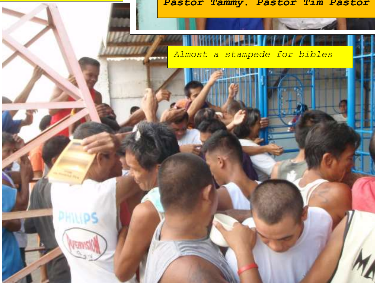
Almost a stampede for bibles