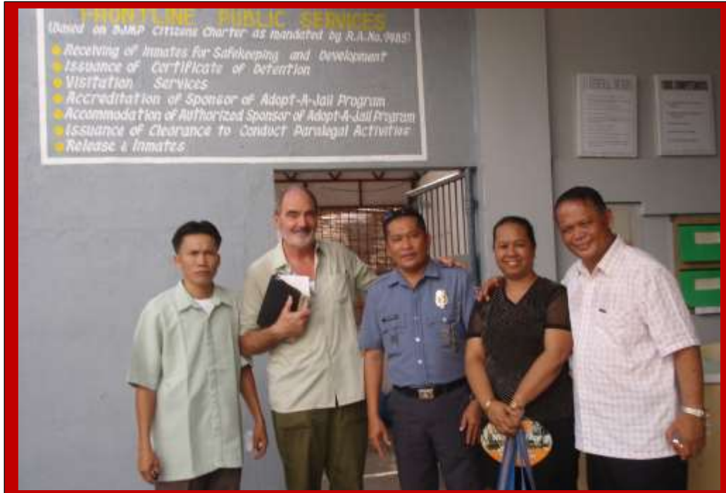
We visit Gilhulagan Prison