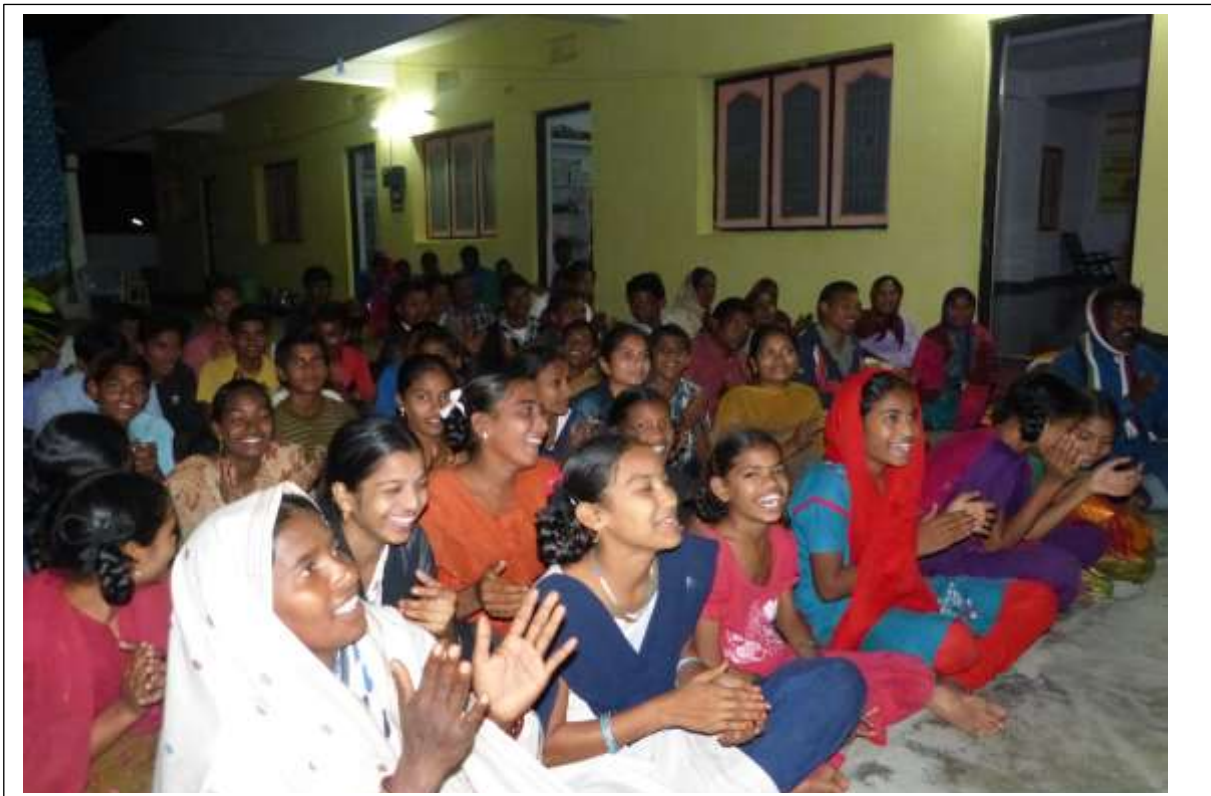
Peduyim home children in the evening worship time

The Lord provided bicycles for poor tribal pastors